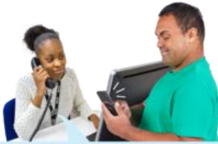
This is the NHS calling to make a Covid-19 vaccine appointment

When your GP surgery contacts you about the vaccine, let them know you have a learning disability and if you will need extra support or reasonable adjustments.