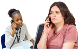
This is the NHS calling to make a Covid-19 vaccine appointment

When your GP surgery contacts you about the vaccine, let them know you have a learning disability and if you will need extra support or reasonable adjustments.