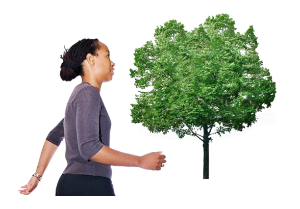
4. After going out