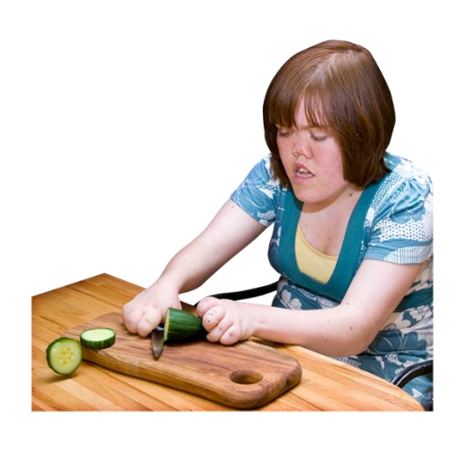
1. Before making food or eating