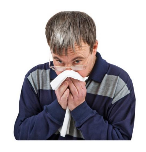
2. After coughing, sneezing or blowing your nose